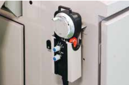
Manual encoder / control 6 sets of registration pins Substrate registration and nesting bar (option)