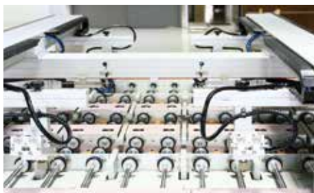
Correcting structure above feeding