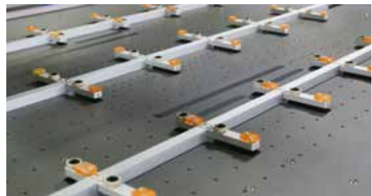
Double vacuum carrier shuttle transfer