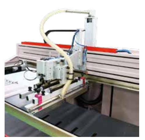
Stable speed printing head carriage + auto ink dispenser (option)