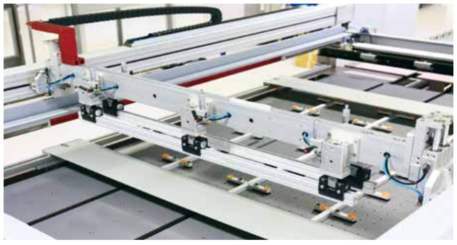
Printing head carriage and nesting bar structure