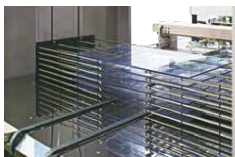
Temporary panel structure